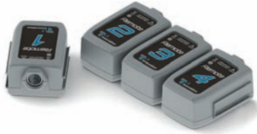
TCC220 includes 4 remotes. TCC200 includes 2 remotes.