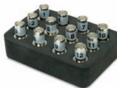
12 ID Only Coax Remotes