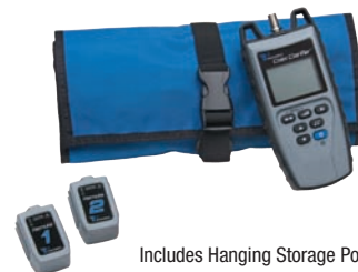
Includes Hanging Storage Pouch